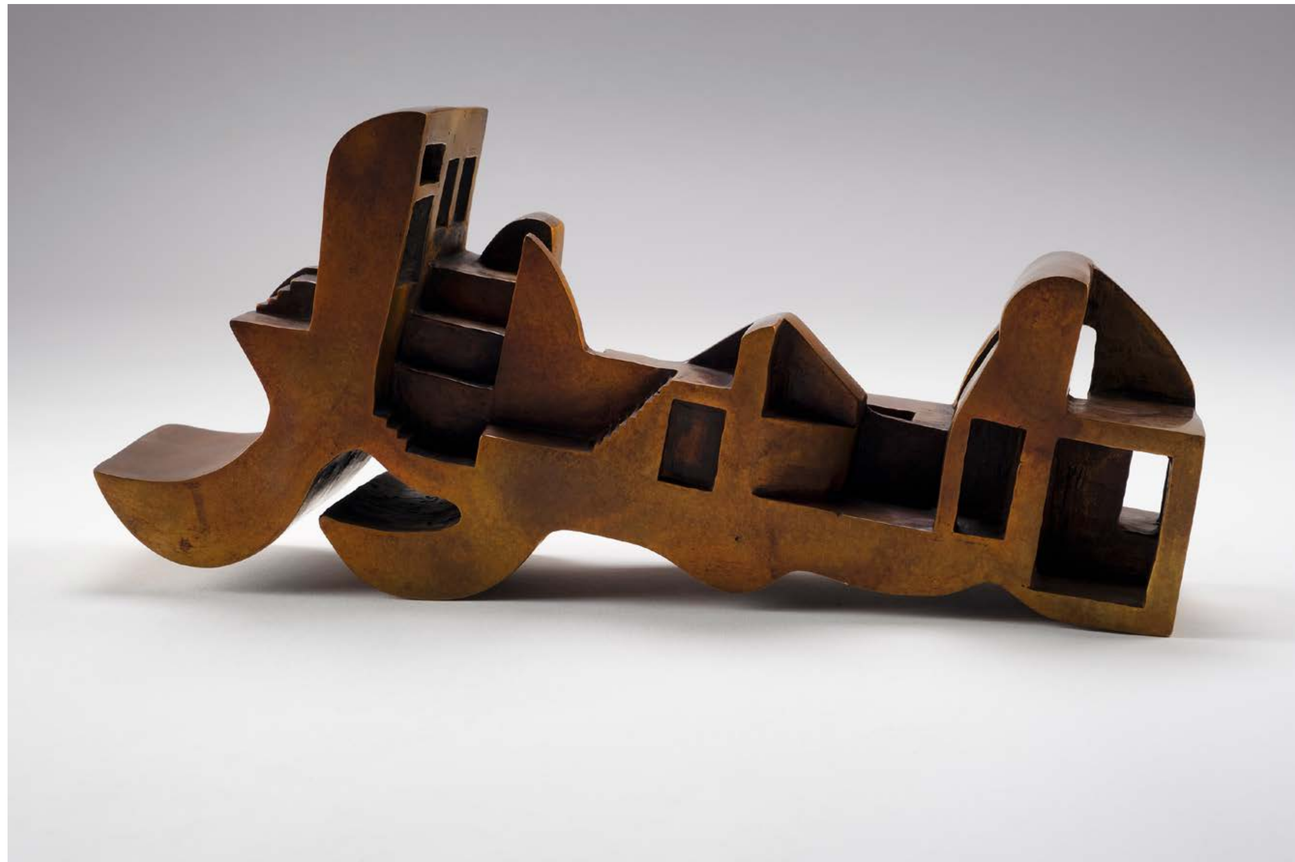
Plain 39 x 17.3 x 9.5 cm bronze 3 editions + 2 AP