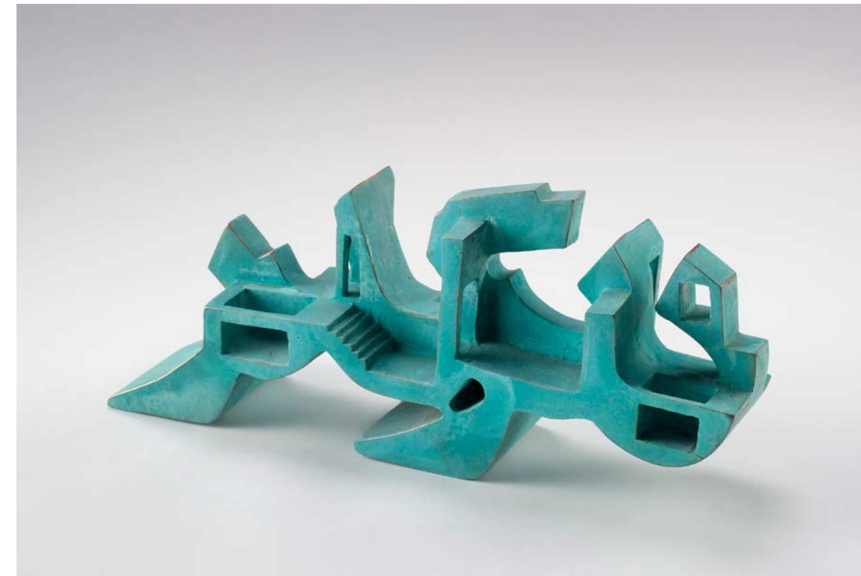
Slow 43 x 18.5 x 9.5 cm bronze 3 editions + 2 AP