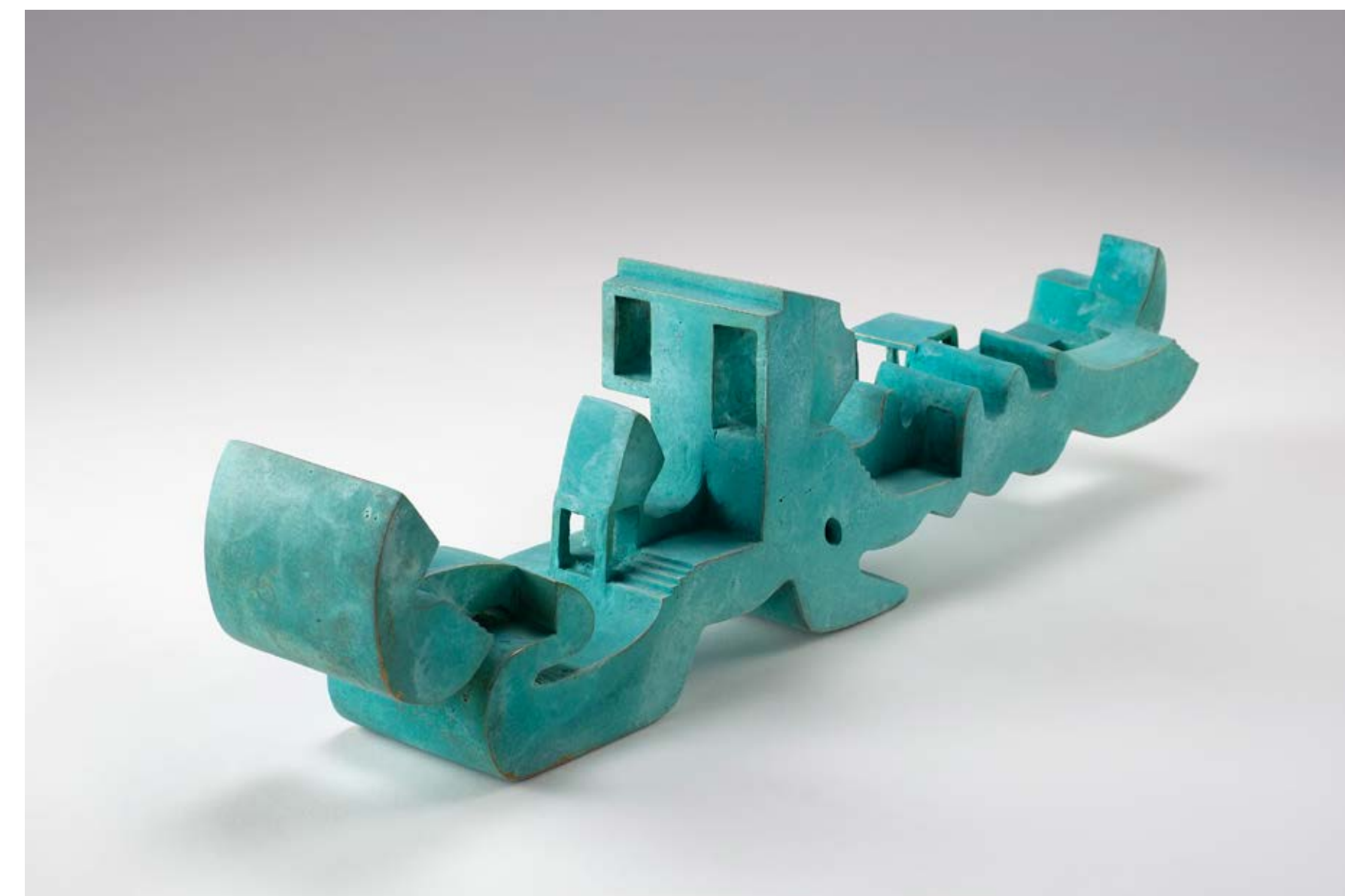
Irreversible 65.5 x 18.5 x 10.5 cm bronze 3 editions + 2 AP