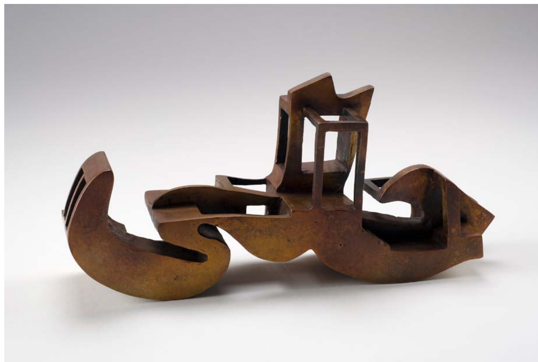
Void 39.5 x 18 x 9.2 cm bronze 3 editions + 2 AP