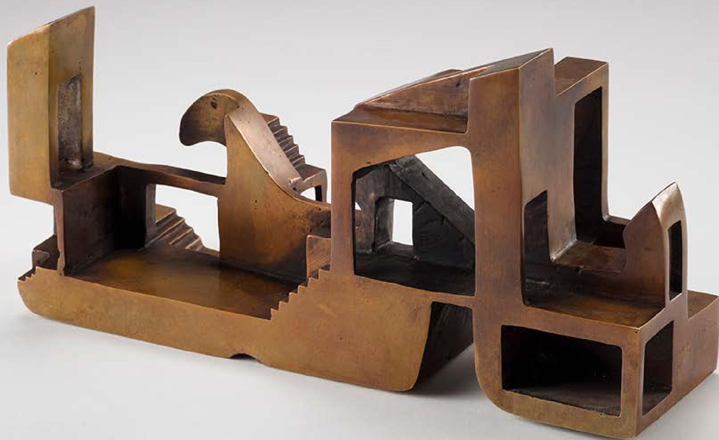
Non-place 35.4 x 17.5 x 10.5 cm bronze 3 editions + 2 AP