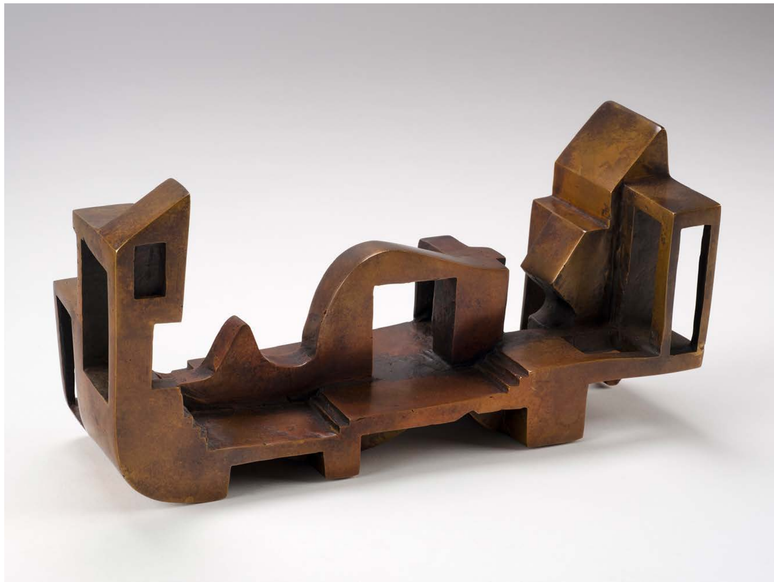
Curve 33 x 16 x 10.5 cm bronze 3 editions + 2 AP