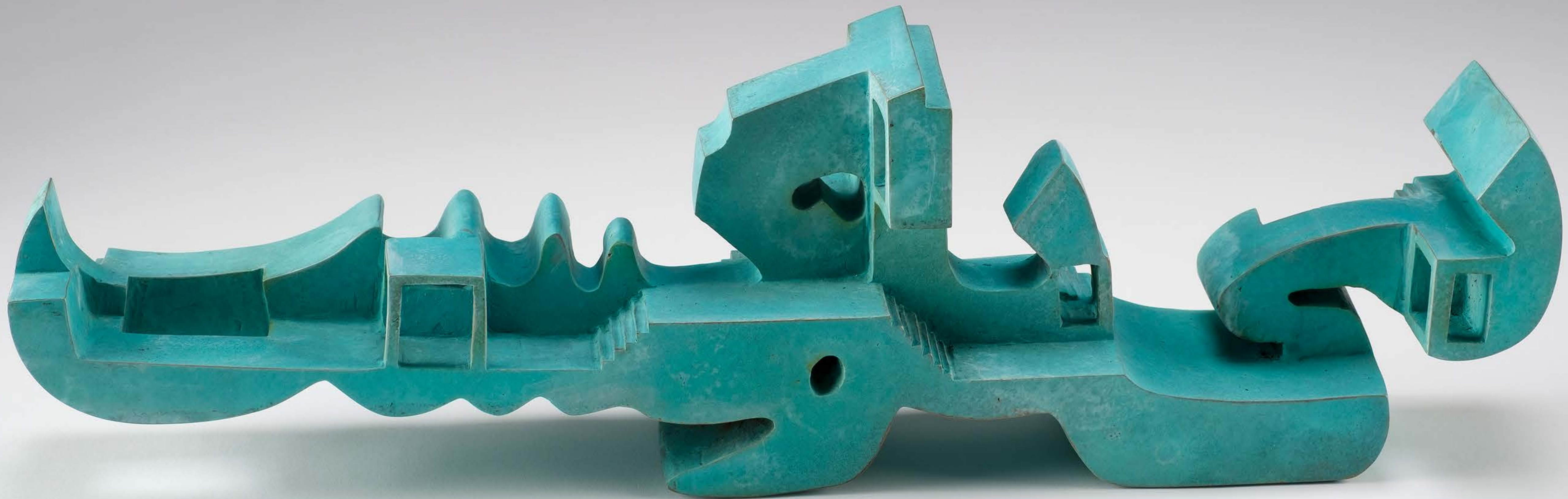
Irreversible 65.5 x 18.5 x 10.5 cm bronze 3 editions + 2 AP