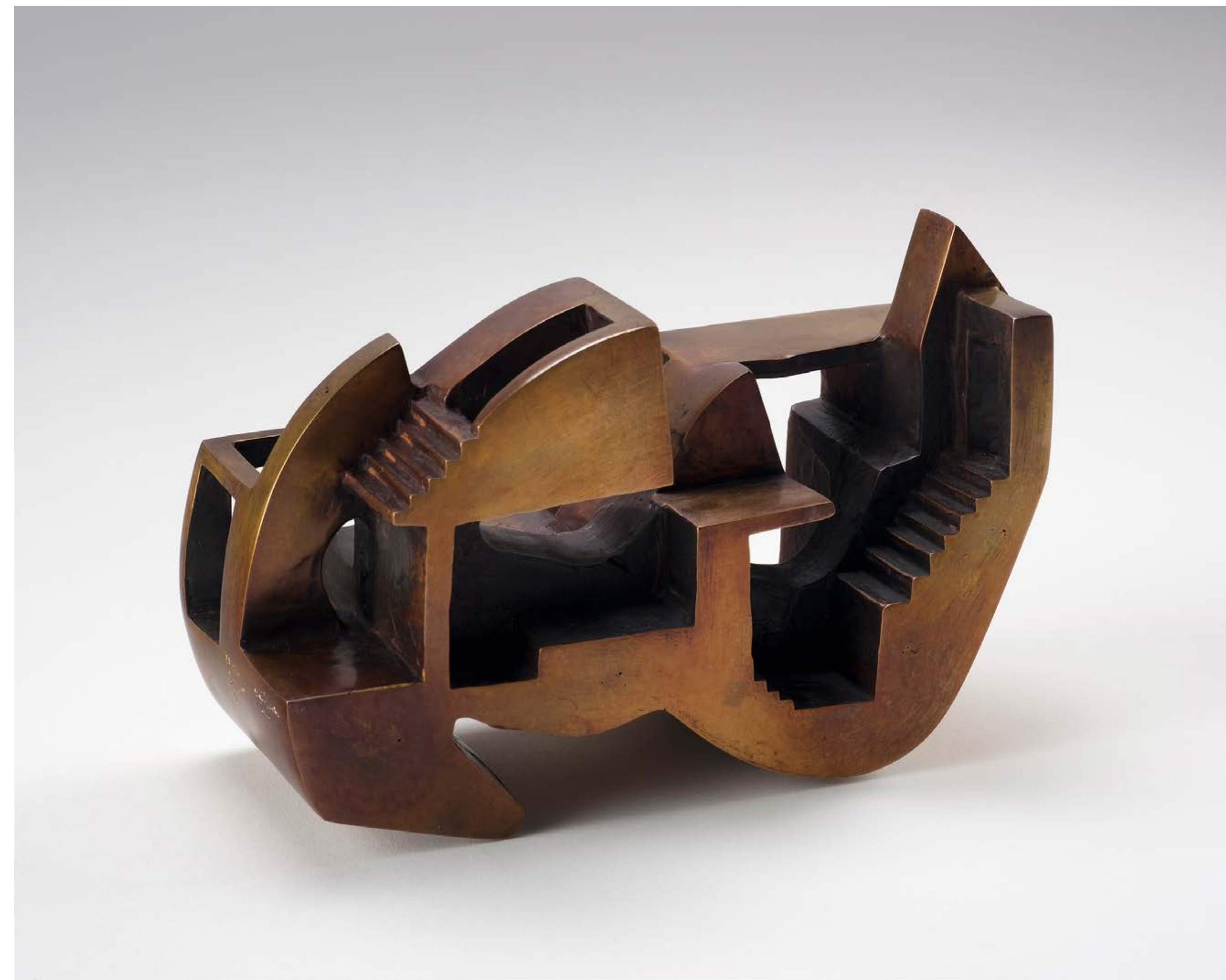
Footprint 24 x 15 x 9 cm bronze 3 editions + 2 AP