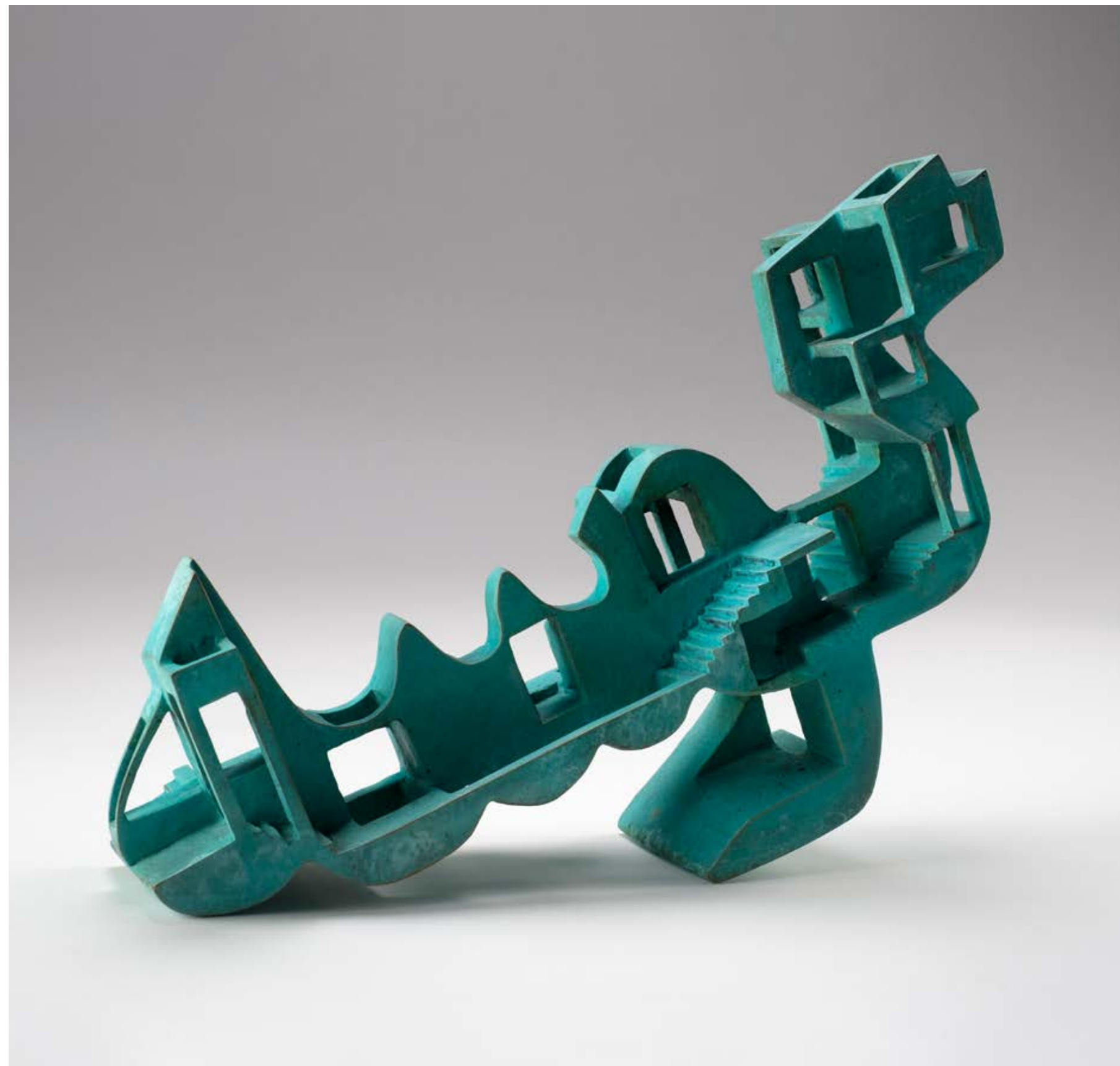
Corner 43.5 x 25 x 9.3 cm bronze 3 editions + 2 AP