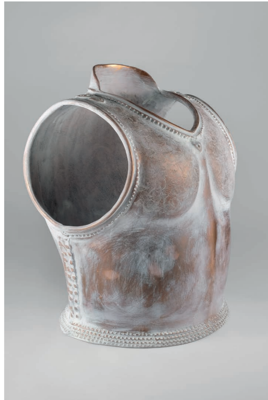
Bronze, 2019 46 x 36 x 26 cm 4 editions + 2 AP