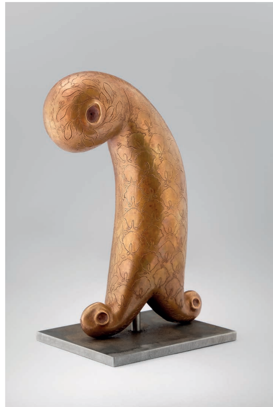
Bronze, 2019 17 x 9 x 5 cm 10 editions + 2 AP