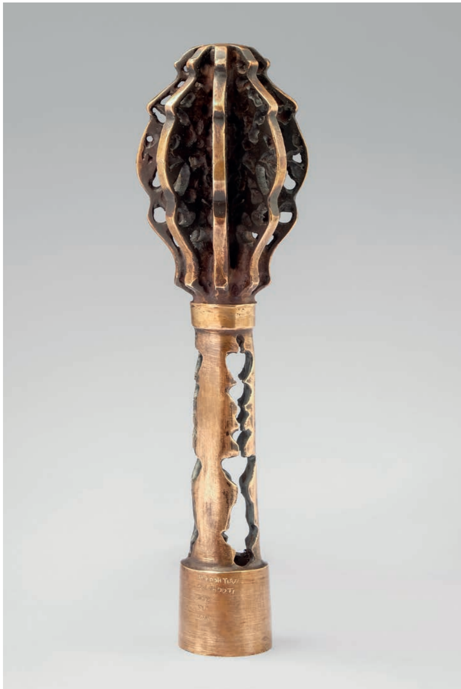
Bronze, 2019 21 x 6 x 6 cm 10 editions + 2 AP