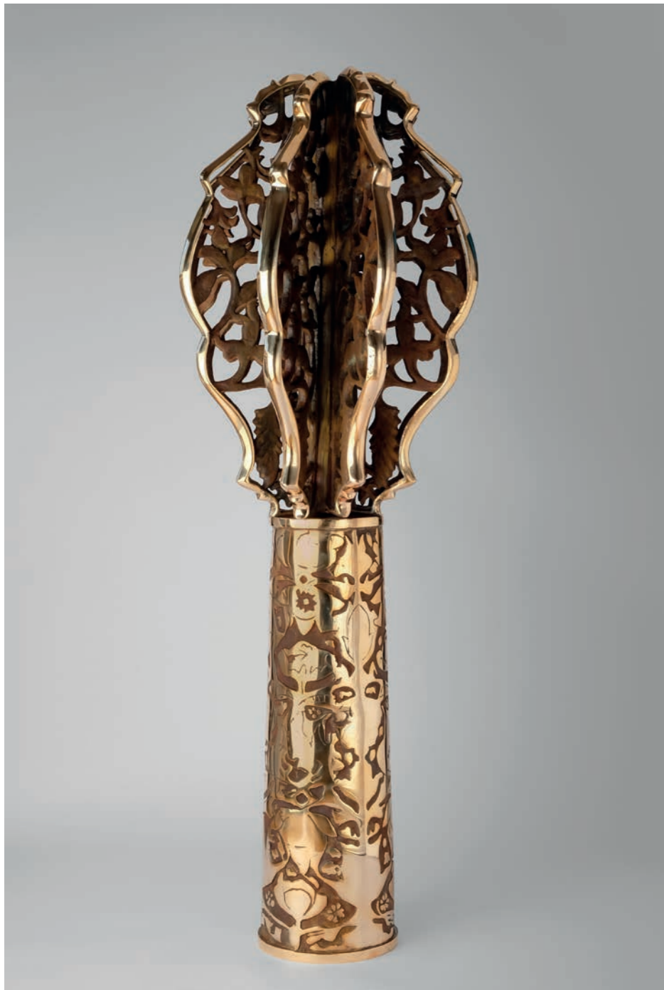
Bronze, 2019 98 x 35 x 18 cm 4 editions + 2 AP