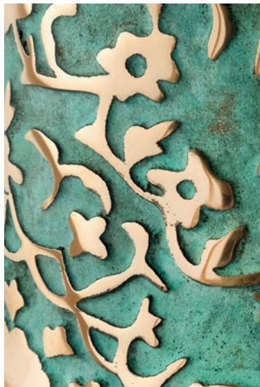
Bronze, 2019 81 x 30 x 10 cm 4 editions + 2 AP