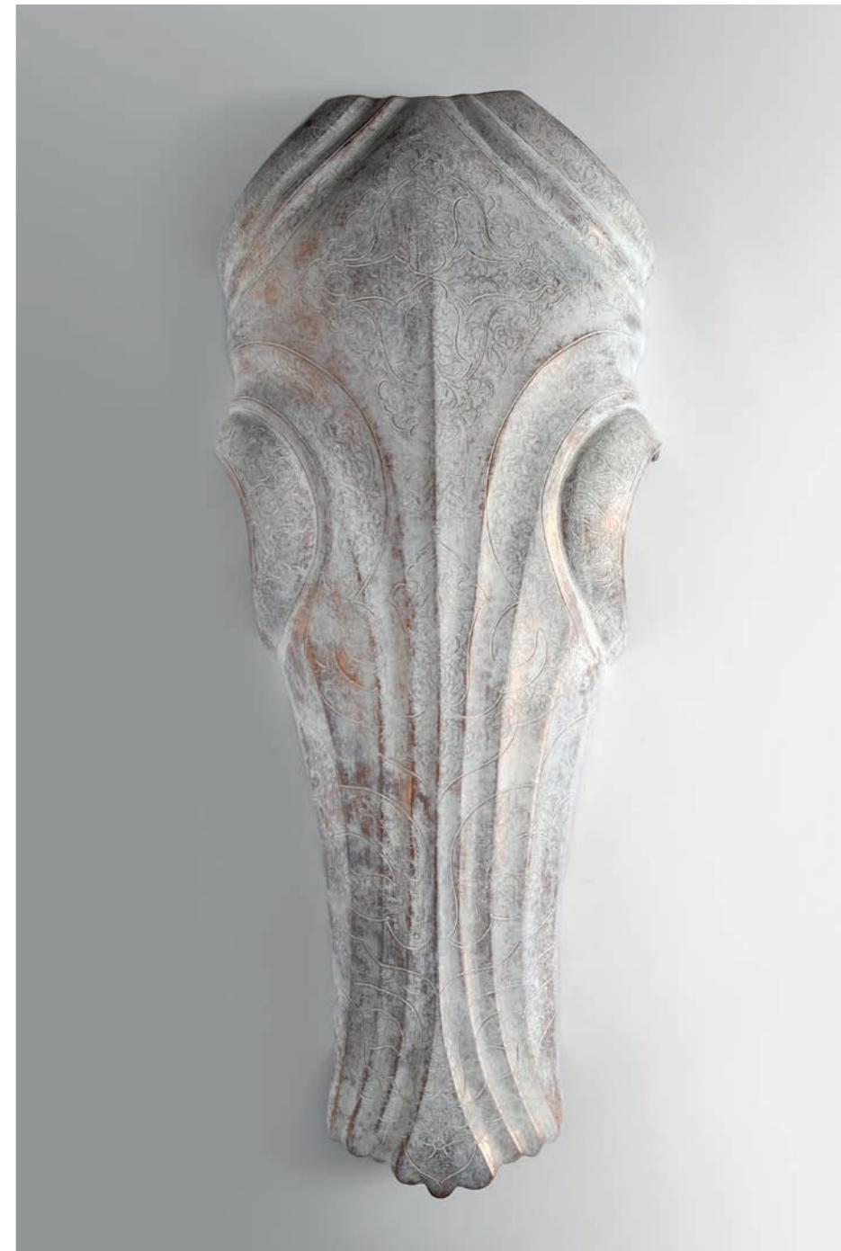
Bronze, 2019 78 X 34 X 12 cm 4 editions + 2 AP