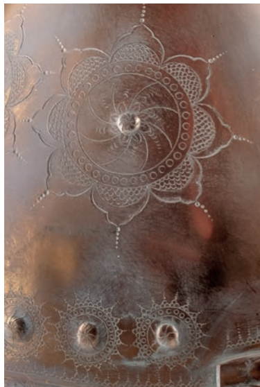
Bronze, 2019 60 x 45 x 45 cm 4 editions + 2 AP