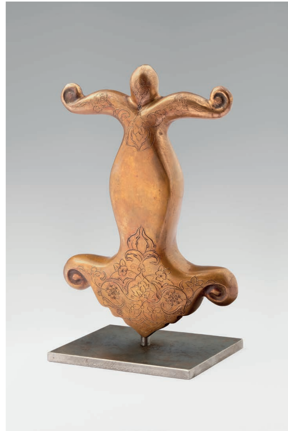
Bronze, 2019 18 x 12 x 4 cm 10 editions + 2 AP